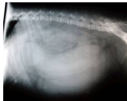
A radiograph showing a closed pyometra.

Stump pyometra is suspected when a mass is seen on radiographs or ultrasound in the area of the uterine stump and there are accompanying clinical signs of pyometra. If surgery ensues to remove the stump and there is no obvious exposure to a hormone-containing product, the area of the ovaries is explored for evidence of ovarian remnant. If no remnant is visible, sometimes biopsies are taken to rule out microscopic remnants. Once the hormone source is gone, there should be no further pyometra risk.