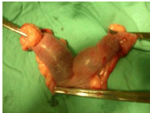
Pus-filled uterus after removal from a small dog